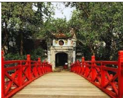
Ngoc Son Temple