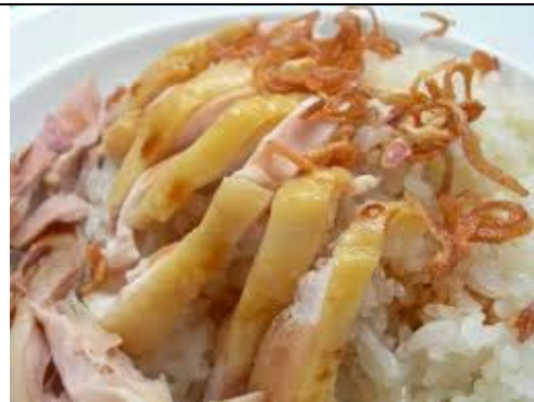
Xôi gà (Sticky Rice with Chicken)