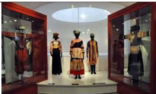
Vietnamese Women's Museum