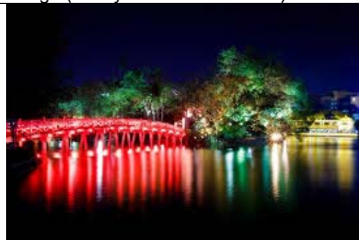
Hoan Kiem Lake