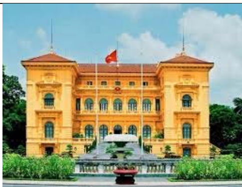
Hanoi Presidential Palace