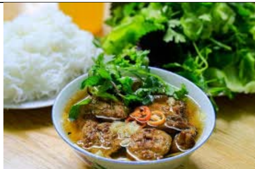
Bún chả (pork noodles)