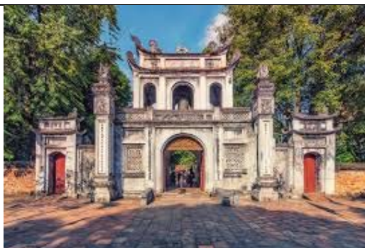
Temple of Literature