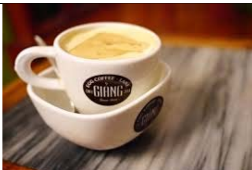
Cà phê trứng (Vietnamese egg coffee)