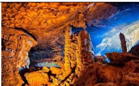
Sung Sot Cave