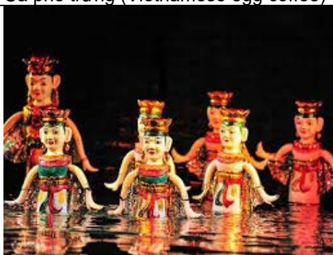
Thang Long Water Puppet Theatre