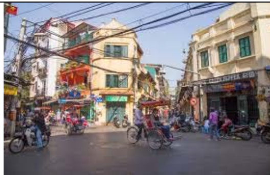
International Corner (Ta Hien Road)